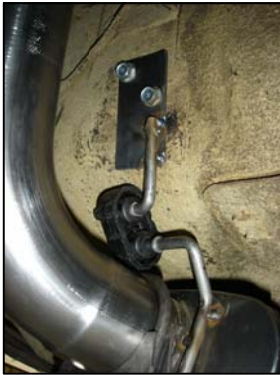
DIAGRAM 2 DRIVER'S SIDE